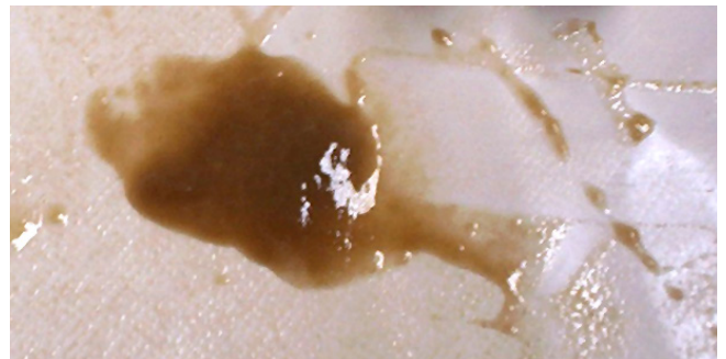
Effectively removes membrane biofilms

Available in 10 kg and 25 kg plastic pails and 1,000 kg bulk bags. Under normal storage conditions the shelf life of Genesol 734 is 1-2 years. Ensure the packaging is sealed after use and the Genesol 734 remains dry.